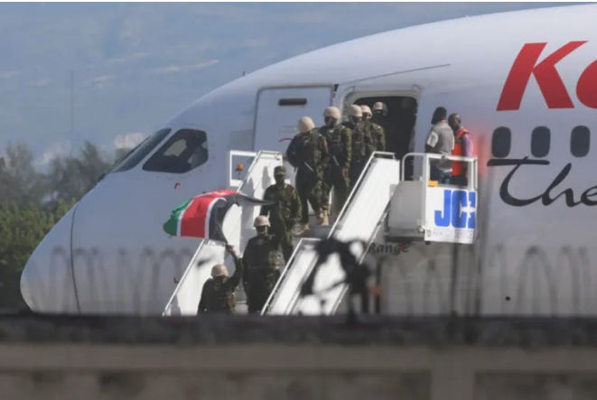
Haiti: Special Police force from Kenya deplane at the

Toussaint Louverture International Airport in Port-au-Prince, Haiti, on Tuesday, June 25, 2024. Kenyan police team leading a United Nations-backed mission touched down in troubled Haiti, after Ruto’s dogged pursuit of the one-of-a-kind deal for an African country. That mission is largely backed and funded by the US.